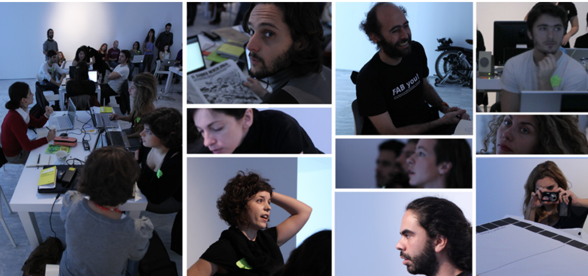
Figure 2. Mapping the Commons, Athens, Hackitectura, 2010. Snapshots from the workshop at the National Museum of Contemporary Art, Athens. Photographer: Demetri Delinikolas. Used with permission via the Creative Commons Attribution Non-Commercial-ShareAlike 4.0 International license.

versity. Theorists, activists and artists with a special interest in the field of the commons were also involved. The scope of the workshop for this interdisciplinary team was influenced by the Italian school of thought and, especially, by the analysis of Michael Hardt and Antonio Negri about the relationship of the commons with the contemporary metropolis. Considering the city as “the source of the common and the receptacle into which it flows,” a cartography of the commons for the city of Athens was attempted in order to highlight the city’s living dynamic and its possibility for change. 7 Participants were therefore invited to turn to multitude’s affects, languages, social relationships, knowledge and interests in order to understand, locate and emphasize commons, which to a great extent were immaterial and abundant, fluid and unstable.